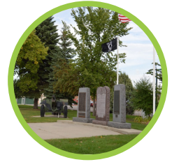
Veterans Memorial Park

Located in Downtown Valley City, the park is easily accessible to downtown shopping and dining. The park features monuments honoring local veterans, a static displays including a missile, a Navy anchor, 2 Howitzer Cannons, and an F104C Aircraft.