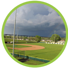
Charlie Brown Memorial Baseball Field

Charlie Brown Memorial Baseball Field is the home for the Viking baseball team. Nestled into the side of a hill, the field is well-known throughout the state of North Dakota as a great place to watch a game. It is also home to the Valley City State University Vikings, the Valley City Post 60 Legion baseball team, the Valley City High School team, and several youth and amateur baseball programs.