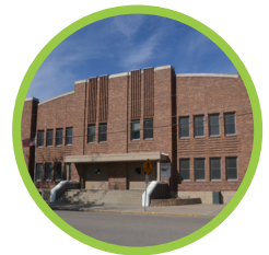
Recreation Center Gym

The Rec Center is a landmark in Valley City with 2 full size basketball courts and is home to adult sport programs and youth tournaments. The Rec Center can also be rented on an hourly or daily basis.