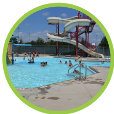
VCPR Community Outdoor Pool

The Community Pool features a zero-depth entry pool with various fountains and slides throughout the pool for younger children. There is also a 148-foot water slide for all ages to enjoy. There is open swimming held daily throughout the summer months. Pool is also available for group rentals.